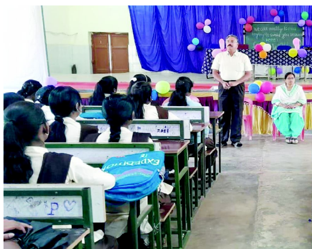
Promotional Meeting at Womens College, Koraput

During the Academic Sessions IGNOU Regional Centre, Koraput conducted good number of promotional Meetings for the benefit of all segments of the society for Admission into various programs of IGNOU in Degree colleges, NGOs district level departments, SOG, BSF Camps, Cobra Battalion, Kendriya Vidyalayas, Navodaya Vidyalayas, Saraswati Vidyalayas, Professional institutions etc.