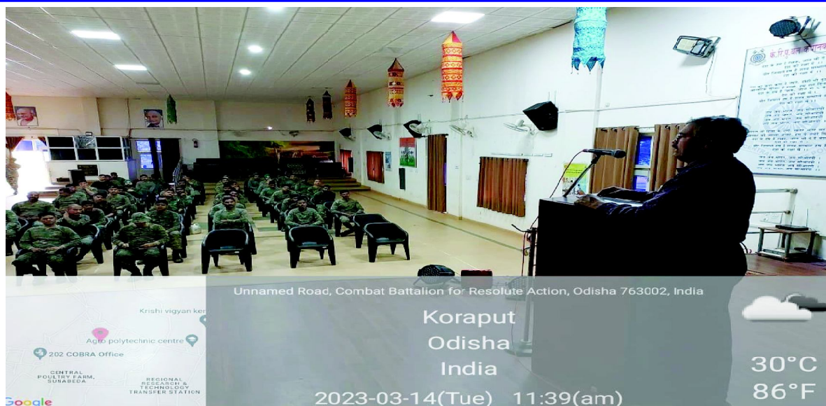
Promotional Meeting at Kobra Battalion, Sunabeda, Koraput