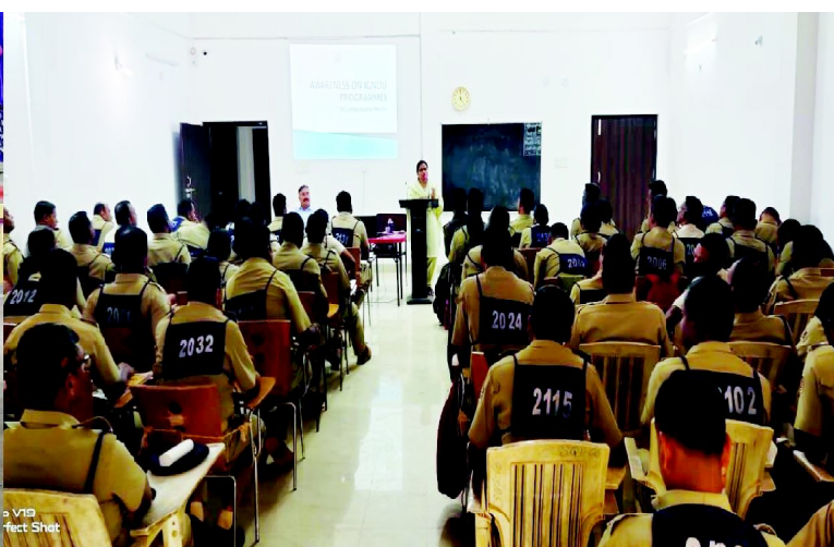
Promotional Meeting at SOG Camp, Koraput